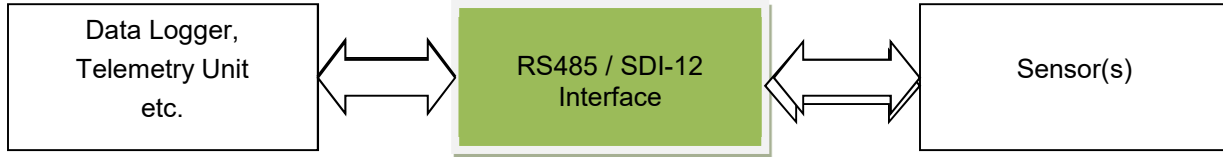
Figure 3 –TBS07 basic application setup

The setup requires a data logger or telemetry unit with RS485 interface capable of handling ASCII strings representing SDI-12 commands. The TBS07 receives commands from the RS485 Interface (e.g. via data logger, RTU or PC), and transfers the commands to the SDI Interface, waits for sensor response and transfers the response (measurement results, etc.) back to the RS485 Interface of the data logger, RTU or PC. All SDI-12 commands are supported. It transparently forwards SDI-12 commands and sensor response in ASCII between a master with RS485 interface and sensor(s) with SDI-12 interface. It takes care of all SDI-12 standard related protocol and electrical requirements.